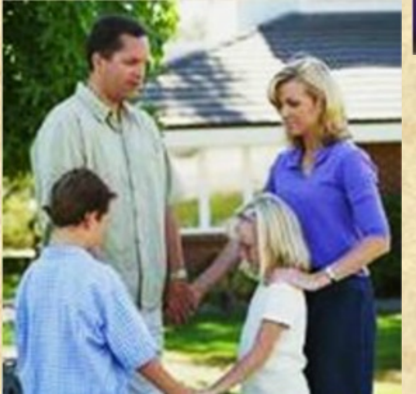
Jesus Should Be Over All Families

Jesus Is Over the World, Especially Those Who Obey Him