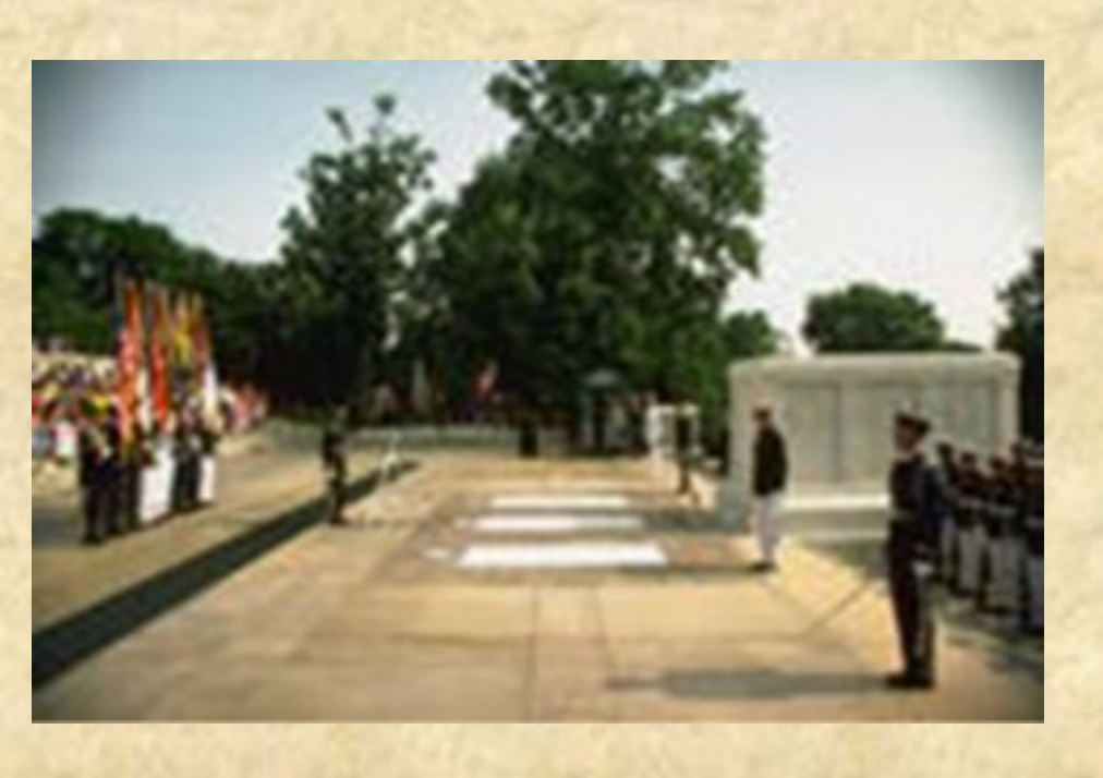
Even for the "Unknown"